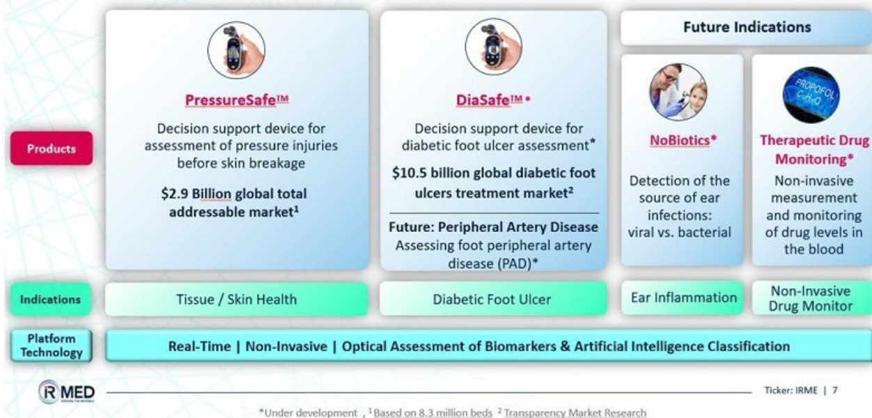
Fig1. IRMED AI-Driven Point of Care Decisions technology platform